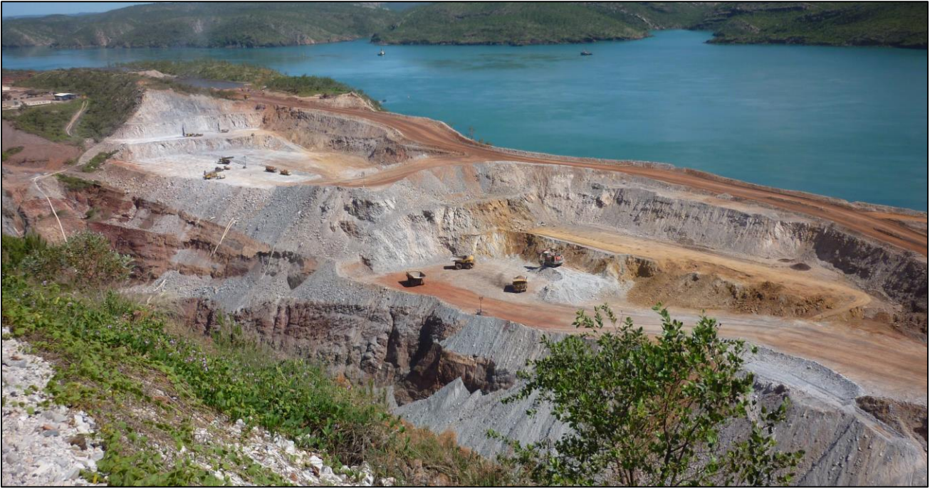
Figure 1: Waste mining in the eastern end of Koolan Island Main Pit during March 2014.

The accelerated waste mining activity in Main Pit also positioned Koolan Island to accelerate ore production in the June quarter. Mount Gibson therefore anticipates that the wet weather interruptions in the March quarter will have no material impact on shipping from Koolan Island in the 2014 financial year. The Company also remains on track to achieve an annualised ore production rate of 4 million tonnes per annum at Koolan Island by the end of calendar 2014.