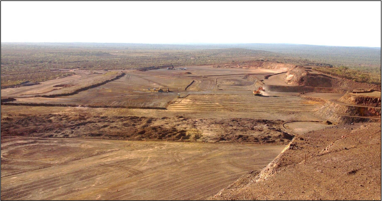
Figure 2: The Extension Hill open pit in March 2014, looking north.

At the end of March, approximately 152,000 tonnes of crushed finished product was stockpiled at the mine. Uncrushed product stockpiled at the mine totalled approximately 180,000 tonnes. Mine-site stockpiles of uncrushed lower grade material totalled 2.0 million tonnes at the end of the quarter.