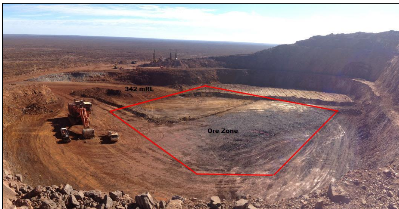
Figure 3: Mining in the T1 open pit in March 2014, with the ore zone shown in red.

Production and shipping statistics for Tallering Peak are tabulated in Appendix A.